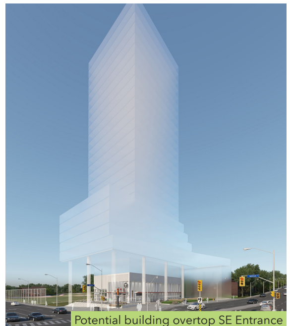
Potential building overtop SE Entrance